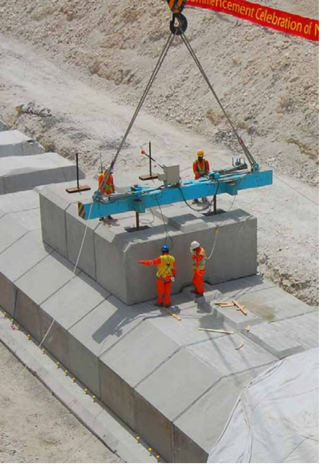
First quay wall block installed

The first phase of the project is expected to be completed in 2016, and future phases will become operational as the need arises. Forecasts suggest that Qatar's economy will